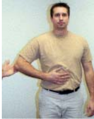
Fig. 2: During the Belly-Press test, the patient applies pressure against the stomach. The elbow should be maintained in the coronal plane without flexing the wrist. The test is positive when the elbow moves posteriorly after the clinician removes his hand or the patient flexes his wrist to maintain contact with his belly.