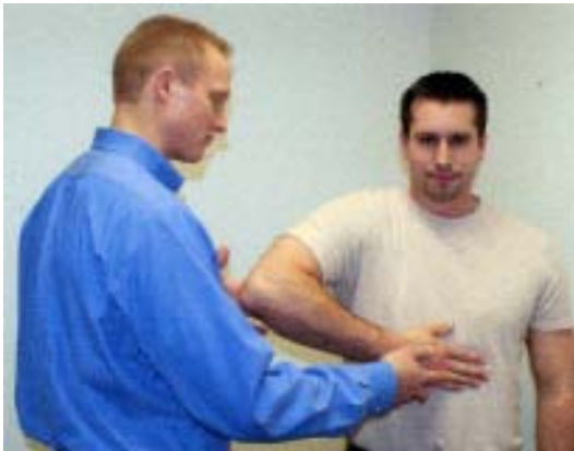
Fig.3A. The Belly-Off sign

Scheibel et al in 2005 [11] described a new clinical sign for lesions of the subscapularis, which they named the Belly-Off sign. The test for the Belly-Off sign starts with the examiner bringing the affected arm passively into flexion and maximum internal rotation with the elbow flexed to 90°. The elbow of the patient is supported by one hand of the examiner, while the other hand places the palm onto the abdomen (fig. 3A).