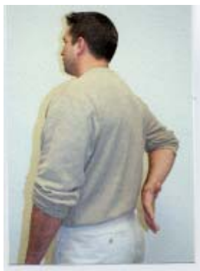
Fig. 1: During the Lift-Off test, the patient is asked to maintain the space between the back and the hand. Inability to hold this position indicates a torn subscapularis tendon.

The Lift-Off test was originally described by Gerber and Krushell in 1991[6]. During the Lift-Off test, the arm is extended and near maximum internal rotation.