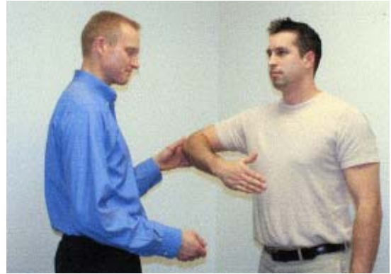
Fig 3B. The Belly-Off sign (positive test).

The patient is asked to keep the wrist against straight and to actively maintain the position of internal rotation as the examiner releases the wrist while maintaining support at the elbow. If the patient cannot maintain this position, the hand lifts off the abdomen resulting in a positive Belly-Off sign (fig. 3B).